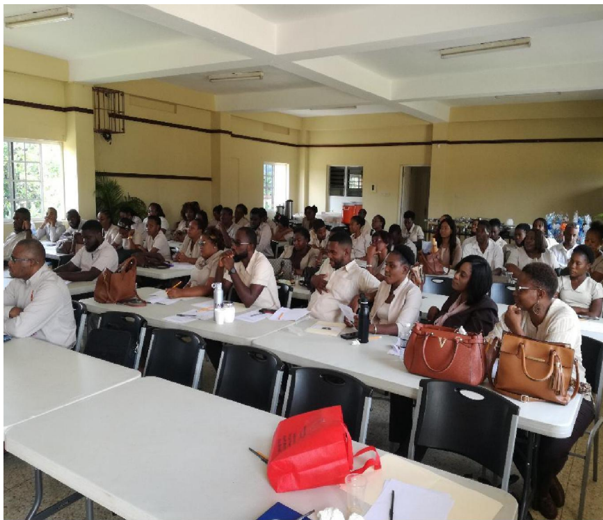
Fig 2: Showing Public Health Inspectors in Southern Region very attentive at Regional Training.

These topics have been selected not only because of their importance to environmental health protection, but also to give PHIs knowledge on the importance and methods of carrying out these programmes.