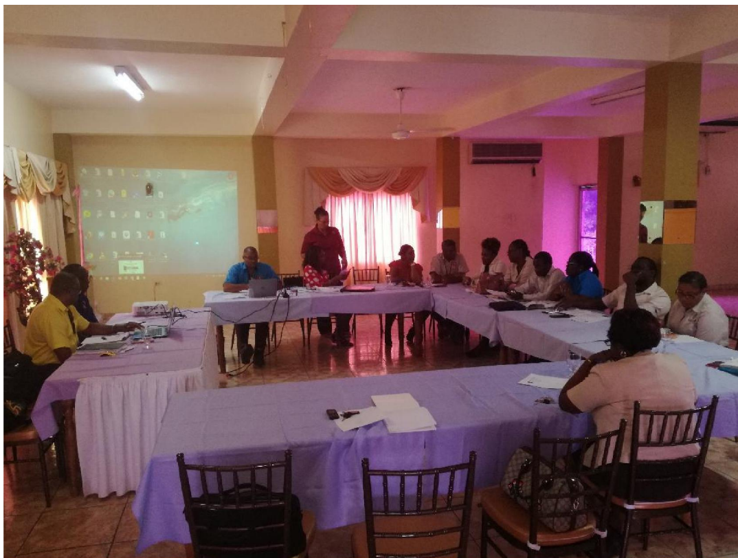
Fig 4: Showing Members of Executives and Parish Representatives in a meeting.