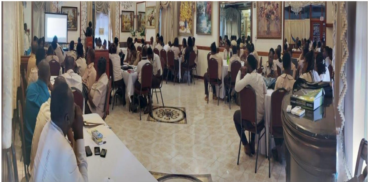
Fig 1: Showing Public Health Inspectors in Western Region at JAPHI sponsored training.